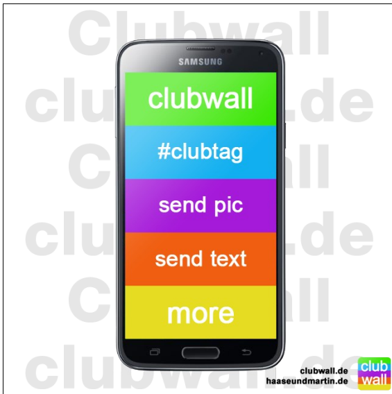
Clubwall messenger: enter #hashtag, send photos and messages