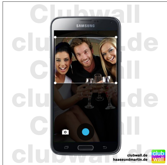
Clubwall messenger: take a picture, crop, send