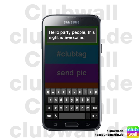
Clubwall messenger: enter text and sent it to the Clubwall