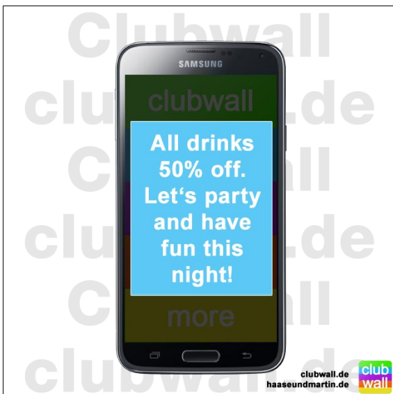
Clubwall messenger: get a message from the organiser